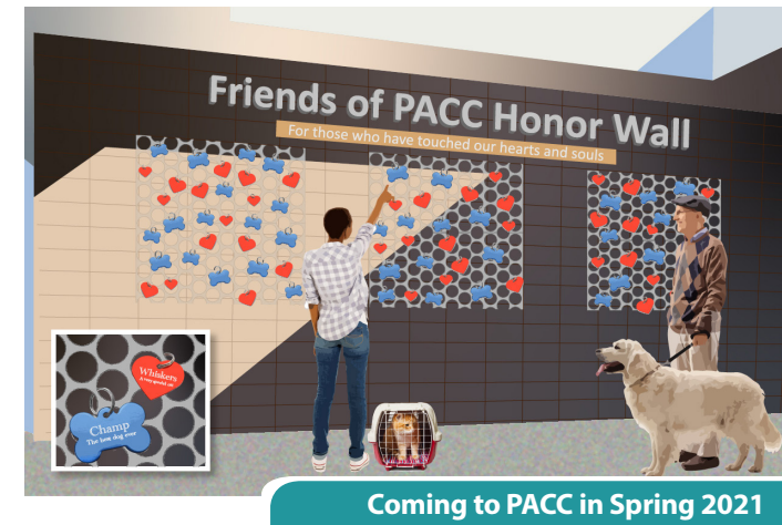
Coming to PACC in Spring 2021

And in spring of 2021 the honor wall will be installed at the shelter just outside the adoption lobby. This evolving art piece will be a testament to the incredible bond between pets and people.