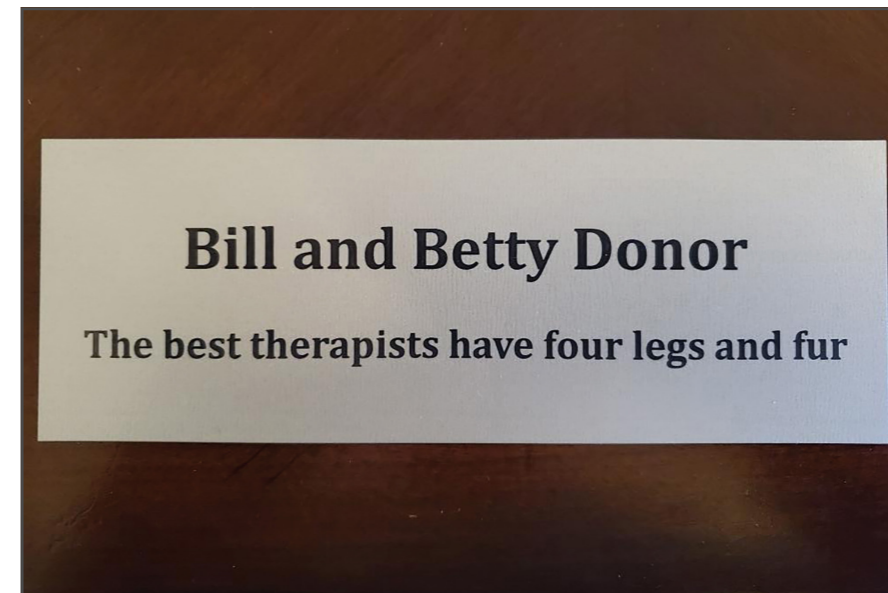
Sample of the Kennel Claim nameplate.

What do you think of when you think about what a lasting legacy is? Much like our Honor Wall that holds the names and memories of loved pets, past and present, this Spring, Friends of PACC will be offering an incredible new opportunity to leave a lasting legacy at Pima Animal Care Center.