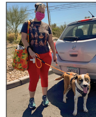
Adoptor with Angus.