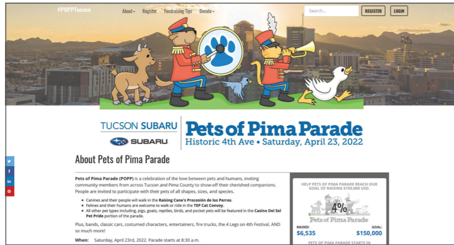
The Tucson Subaru Pets of Pima Parade website.

• Casino Del Sol Pet Pride: All other companion animals take center stage during the Casino Del Sol Pet Pride segment of the Parade. Ever seen a turkey on a leash? Or a turtle in a trailer? Do you know what a heard of pigs is