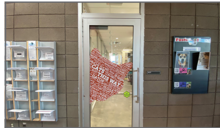
Entrance to cat adoptions at PACC