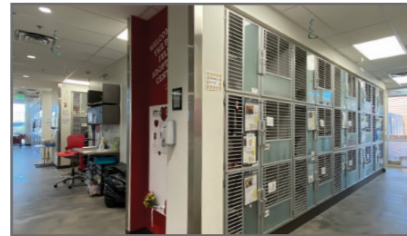
Inside cats adoptions at PACC