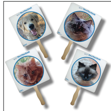
Samples of Petsicles.

• Kids Court: Post-parade fun and games to be had by the whole family, including face painting, balloon art, reading to pets, and more.