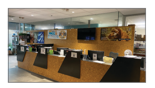
Adoptions Desk, PACC.

What's a fun fact about you? A fun fact about me is that I like roping and would one day like to have my own horse to go roping and participate.