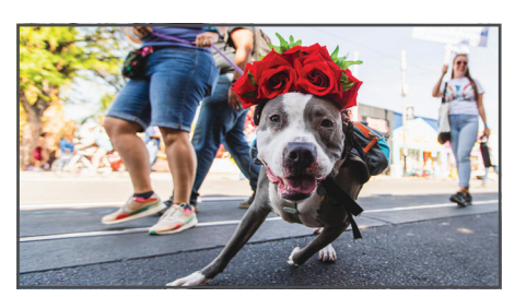
Beautiful dog wearing roses.

For more info on the Parade, how to register to walk in the Parade, or share your pics and stories visit www.petsofpimaparade.com